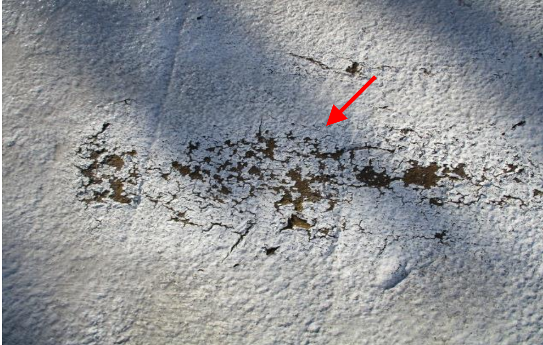
The flat roof areas over the Arizona room and back patio are in poor condition.