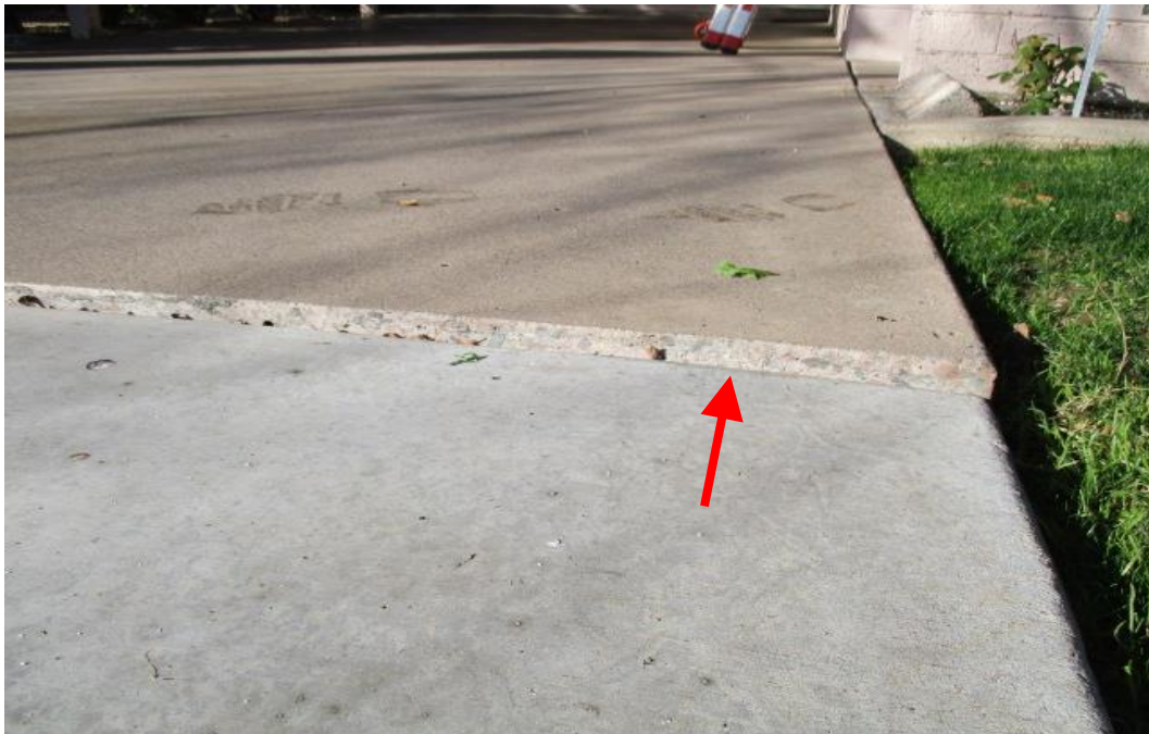
There is an off-set in the driveway that could be a trip hazard.