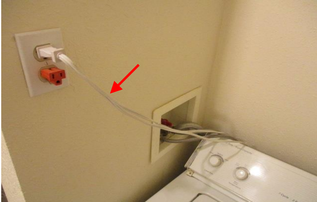
The washer and dryer are powered with an extension cord.