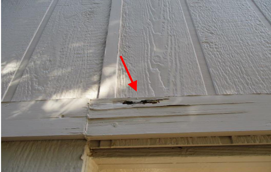
There is damaged wood trim at the side of the carport.