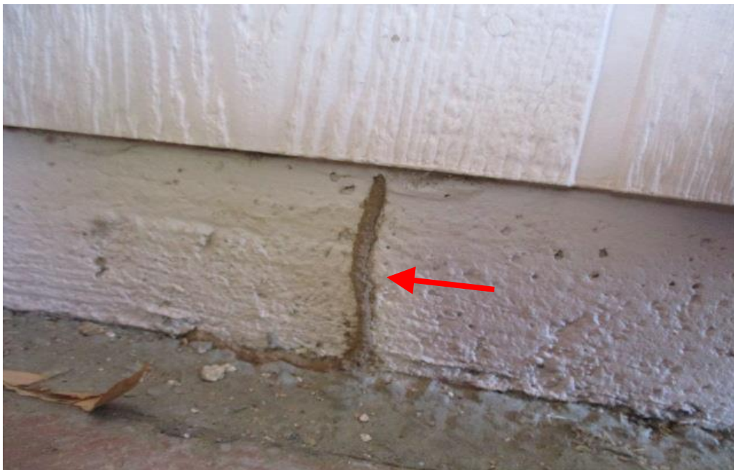
There are termite tubes on the back patio.