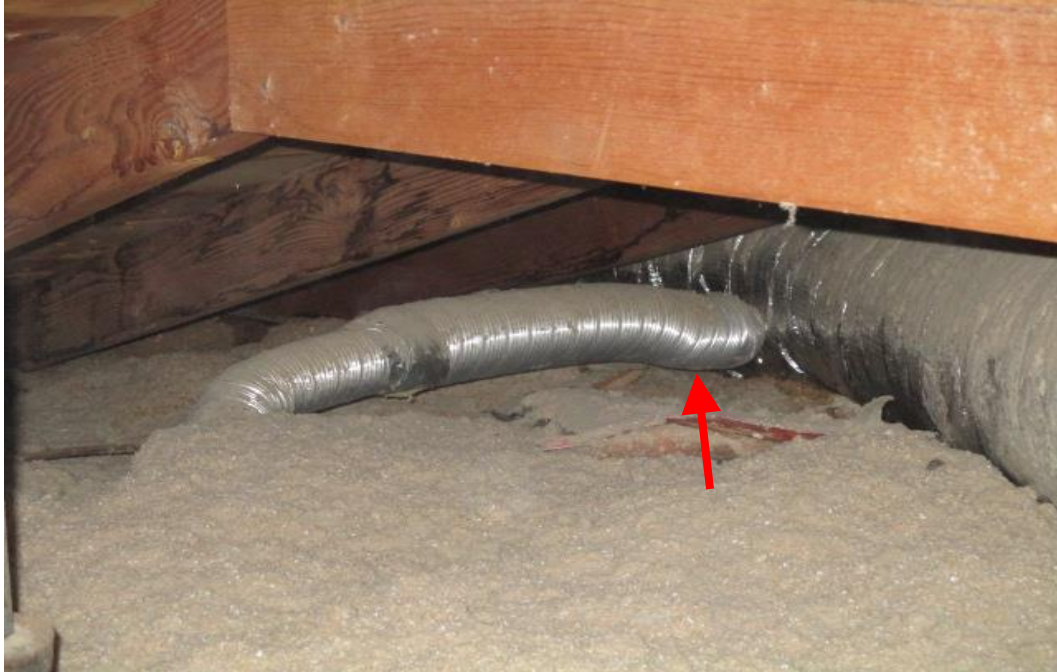
It appears the duct for the hallway bathroom exhaust fan terminates in the attic.