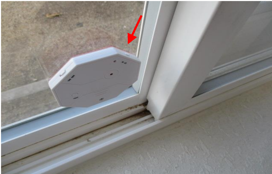
The security system component installed on the master bedroom window blocks the window from being opened.