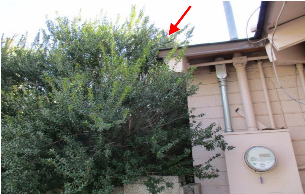
There is vegetation overgrowing the walls/roof.