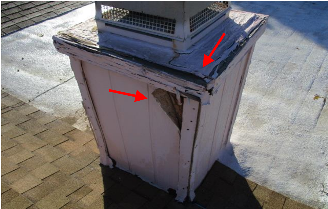
The wood around the chimney is in poor condition.