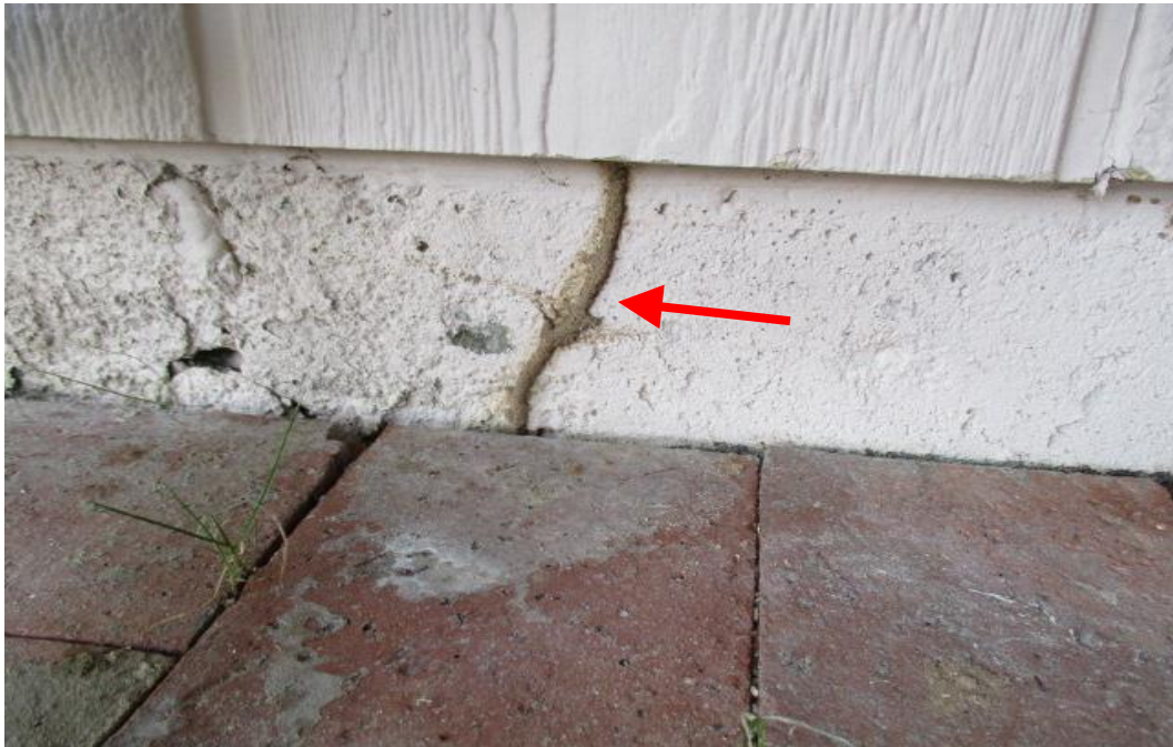
There are termite tubes on the back patio.