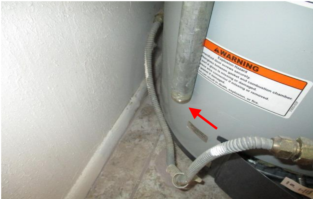
The water heater pressure relief drain line terminates in the laundry room.