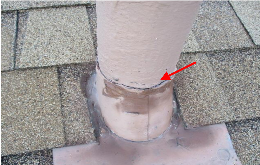
There is a crack in the seal around the water heater vent pipe.