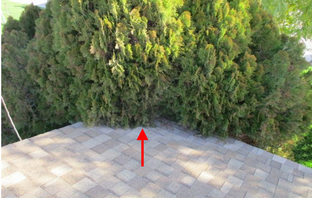
There is vegetation overgrowing the walls/roof.