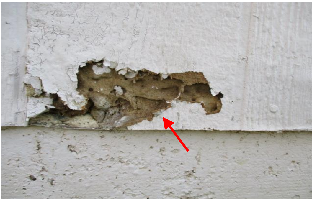
There is damaged siding at the back of the house.